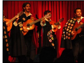
Tuna Universitaria de Salamanca