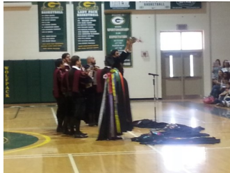
The Tuna plays for Greenbrier High School and Evans High School.