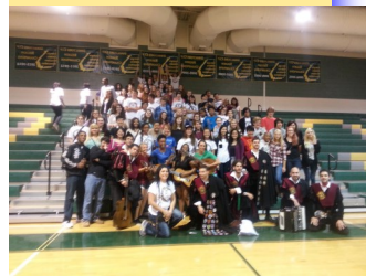
The Tuna and Evans High students after numerous selfies with their faves—lots of new fans!